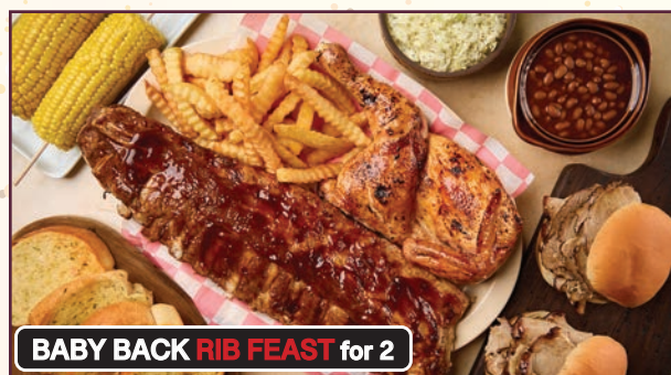
BABY BACK RIB FEAST for 2

Our pork ribs and hickory-smoked chicken. 22.49