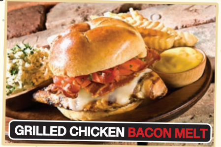
GRILLED CHICKEN BACON MELT