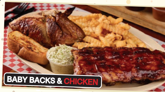
BABY BACKS & CHICKEN

Our award winning Texas brisket, and our hickory-smoked chicken. 21.99