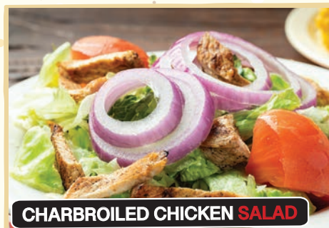
CHARBROILED CHICKEN SALAD

Crisp romaine lettuce with homemade croutons, served with freshly grated parmesan cheese and creamy Caesar dressing. 7.99