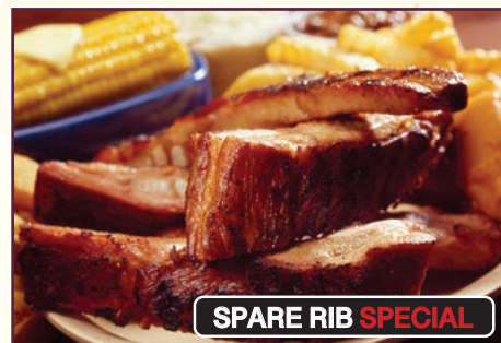
SPARE RIB SPECIAL

Our tasty hickory-smoked chicken marinated in our original BBQ sauce. Finished on the char-grill. All white meat add 1.00