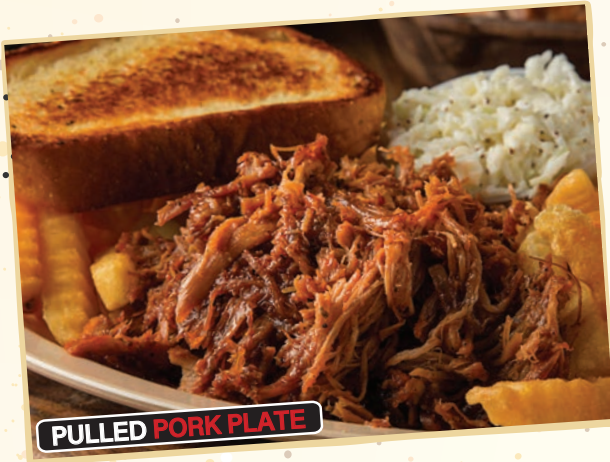
PULLED PORK PLATE

Add 5 Wings to any Meal 8.49 Add a Sausage to any Meal 4.99